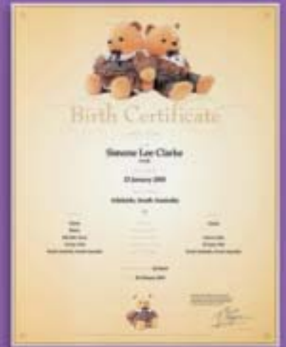
Code Teddy Bears