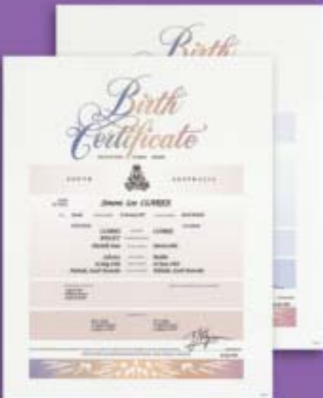
Code Australian Pink